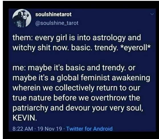
You Ready? [Digital image] (2020)

The world exists as a flow, between nature and human, human and technology, nature and technology. As Hung (2014) suggests, “The natural plane does not seek to distinguish between natural and human, but to think about how people enter a diverse relationship with other beings” (p. 155). As desire emerges into being, the act touches upon and through the boundaries of the other. Humanity is suffused with nature, touching upon and by it. Without the definitions, words, and concepts from which the world is built, the divisions between objects and beings of the world exist within a state of flux. What stops one from seeing human technology as a natural object? Would it change how we build our technology to see it as emergent from nature? Perhaps if we saw our houses, cars, and clothes as pieces of the world that are continuous with it, we might inevitably feel into an understanding of return, where created objects may emerge from an return to the Earth. We might begin to feel that even our stuff belongs to the Earth and thus exists within a cycle of perpetual regeneration and decay.