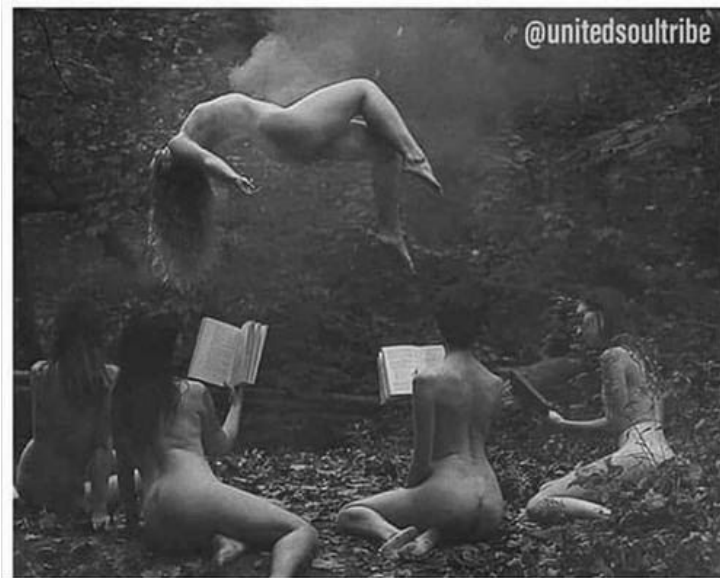
It's Friday Bitches [Digital image] (2020)

COWORKER: What you doing this weekend? ME: Just hanging with some friends