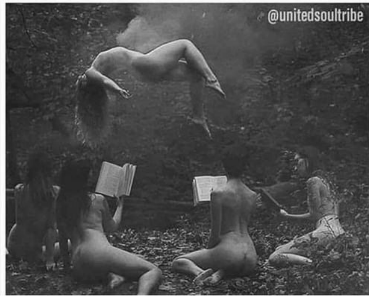
It's Friday Bitches [Digital image] (2020)

COWORKER: What you doing this weekend? ME: Just hanging with some friends