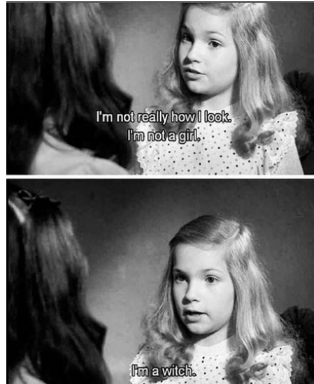
I'm a Witch [digital image] (2020)

In the “I’m a witch” meme, we see the rejection of externally imposed identities. We see a girl, addressing another person in an instructional tone, explaining that she is not, in fact, a girl but is instead, a witch. Her image does not encapsulate her being, rather the image represents a declaration of being that becomes a storying of the self. One may choose one’s identity despite, and even in contrast to, the social construct that is suggested by one’s image. In Haraway’s (2016) notion of the cyborg, there exists as “a condensed image of both imagination and material reality, the two joined centers structuring any possibility of historical transformation” (p. 7). We can see this at play in the pastoral reimagining of “wild” humanity, in the rejection of socially mediated concepts of the self. We may become a human that runs with the wolves like those documented in Estés’ (1992) survey of the wild woman archetype or we may become witches complicated by contemporary technological realities.