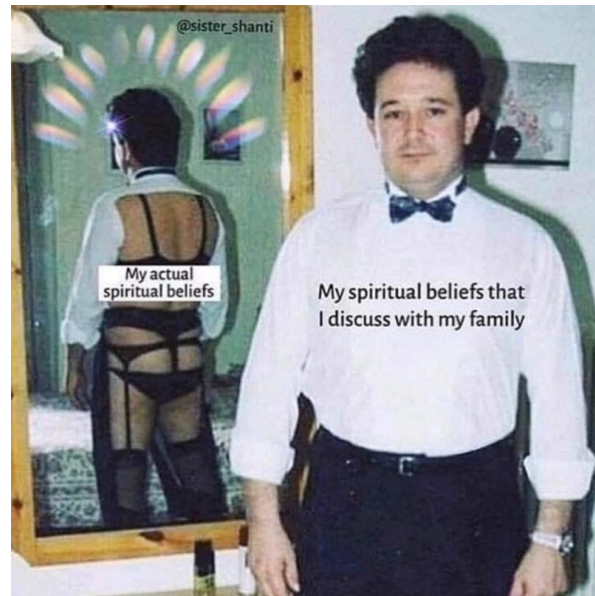
Real Beliefs [Digital Image] (2019)

become one in an ordinary flow and where boundaries between individual and self, individual and community, and individual and world become both flexible and permeable. It is in this shifting world that we enter into a space wherein we may seek forms of identity that look beyond those given to us, reaching into forms of emancipatory identity that emerge from ecologies of the machinic synthesis.