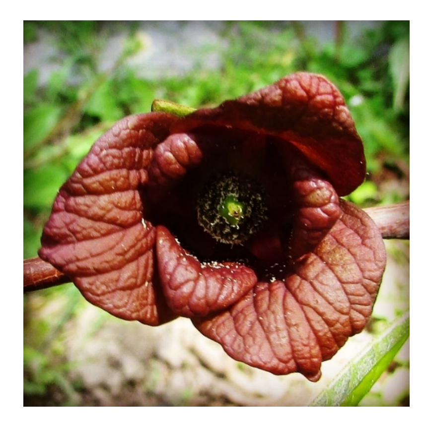
Figure 5. A mature pawpaw flower's distinct colour and bowl shape.

The flowers of the pawpaw tree are protogynous and rarely if ever, self-pollinate (Willson and Schemske 1980; Lagrange and Tramer 1985; Layne 1996; Gottsberger 1999; Lyle 2006; Hormaza 2014; Hormaza et al. 2017; Wyatt 2019; Judd 2019). Judd (2019) explains that "...the flowers, typically, are self-infertile because the female pistils and the male stamens ripen at different times in the same flower".