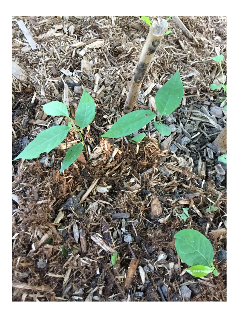
Figure 3. Root suckers from a planted pawpaw tree (Source: Pantaleo, 2019).

Species distribution research in Southern Ontario by Bowden and Miller (1951) found that in a single area, there could be "ten trees or several hundred in one location; the roots spread underground and shoots come up around the larger trees".