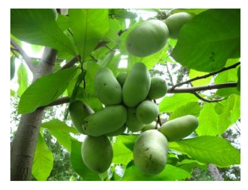
Figure 7. The clustered growth of maturing pawpaw fruits (Source: Trees of Joy 2011).