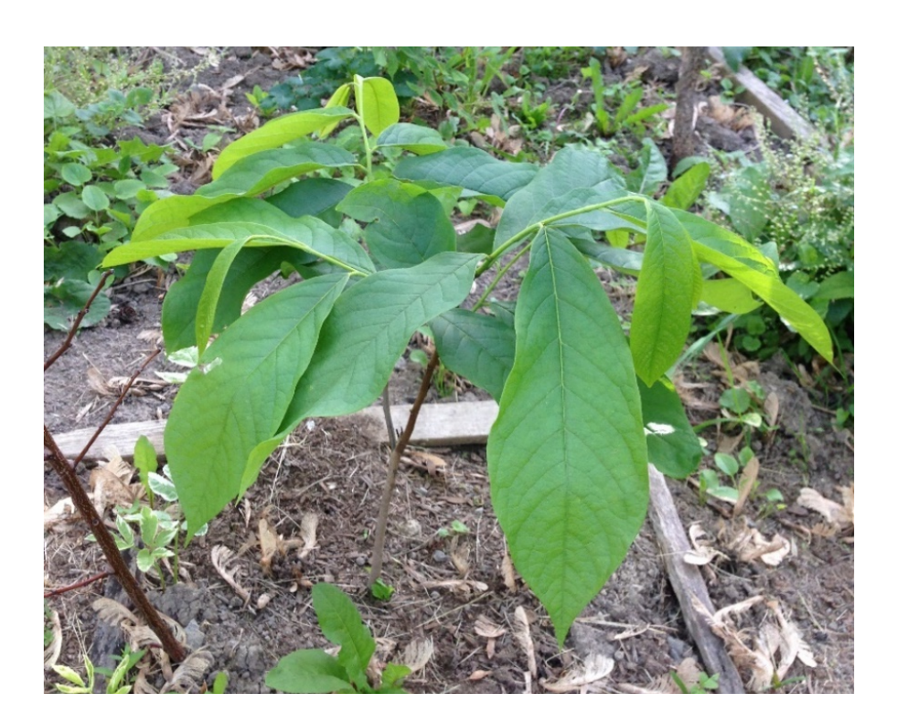
Figure 2. The leaf shape and size give the pawpaw tree a tropical look even with saplings.

As is common with many understory tree species, the pawpaw is very shade tolerant and will still grow in low light conditions (Robles-Diaz-de-Leon and Nava Tudela 1998; OMNR 2000; Farrar 2017; Judd 2019). In natural stands it is often found growing in small groups or thickets; root suckering is a key form of regeneration for this species (as seen in Figure 3) (Bowden and Miller 1951; Willson and Schemske 1980; Layne 1996; OMNR 2000; Lyle 2006; Farrar 2017; Wyatt 2019; Judd 2019).