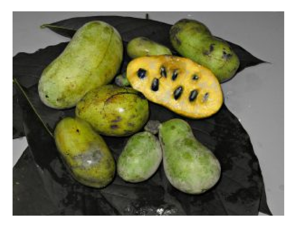
Figure 8. Typical blackish-brown skin of ripe pawpaw fruit. Note the brown bean-shaped seeds and flesh colour.