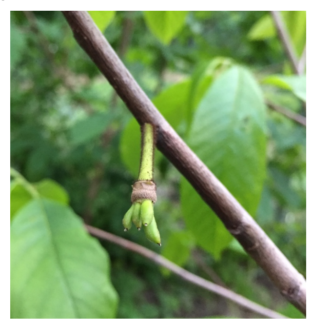
Figure 6. Fruits form where the flower once was (Source: Pantaleo 2019).

Research by the OMNR (2000) concluded that the fruit of Ontario-based pawpaw populations tends to not be as flavourful as the more southern U.S based populations.