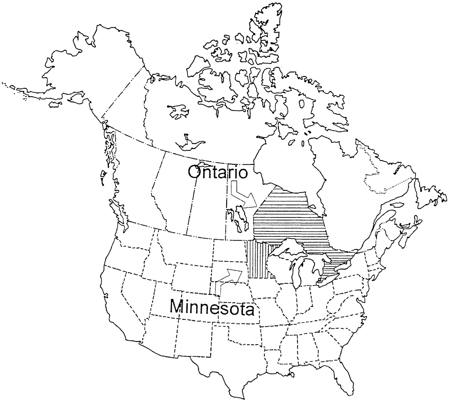
Figure 1. Province of Ontario and State of Minnesota highlighted on a map of North America.