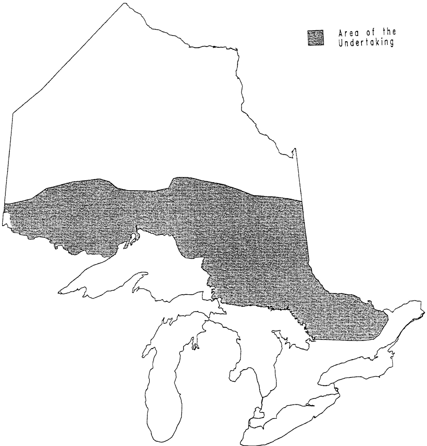
Figure 2. Area of the undertaking in the Province of Ontario.