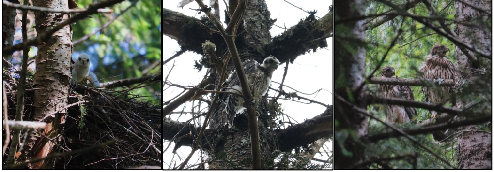
Figure 5: Development of juvenile goshawks. (Source: Hallworth 2020).