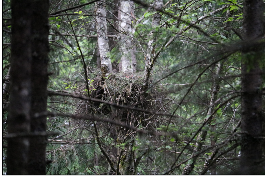
Figure 4: Active coastal goshawk nest on Vancouver Island. (Source: Hallworth 2020).

Most goshawk territories contain multiple alternate nests in relatively close proximity, which are used in different years (McClaren et al. 2015). Alternating between nests year by year is important for minimizing exposure to disease and parasites in old nests, and strengthening the pair bond between adults by participating in nest building activities together (Squires and Reynolds 1997, McClaren et al. 2002). Goshawks are central-place foragers during the breeding season; this limits how far they can travel because they are responsible for returning to the nest to feed their young or mate (McClaren et al. 2015). On Vancouver Island, half of all alternate nests are within 200 m of another nest, and 90% are within 500 m; on average, goshawk nest trees are typically within 300 m of each other. (McClaren et al. 2002). Seldomly, a satellite nest will occur beyond one kilometer from other nests (McClaren et al. 2002).