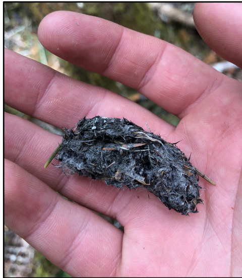
Figure 6: Goshawk pellet from below active nest.

Between May 5 and August 3, annual goshawk surveys were conducted on both newly discovered and previously known territories on Mosaic Forest Management's private land and Crown land timber licenses on Vancouver Island and the mainland coast of British Columbia. During the incubation and nestling phases of the breeding cycle, regurgitated castings (pellets) and prey remains (non-digested material) were collected from Northern Goshawk ( A.r g.s laingi ) nest territories. Territories were predominantly located in Douglas-fir ( P. menziesii ) dominated second growth forest stands. Goshawk pellets and prey remains found below the nest trees and plucking posts were collected at each nest-site, placed in uniquely labeled paper bags, and dried until analyses (Figure 6).