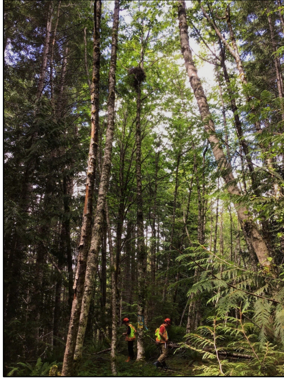
Figure 3: Goshawk nest in a red alder tree on road grade. (Source: Hallworth 2020).

Large stick nests are built within the first half of the tree, just below the live whorls of the tree's canopy (McClaren et al. 2002). Within the stand, nests are typically situated in trees with larger diameters; although they do sometimes occur in smaller trees with deformities such as hemlock dwarf mistletoe or multiple leaders which act as sufficient nesting platforms (McClaren et al. 2015). On Vancouver Island, nests were an average of 92 cm across and 8 cm in cup depth (Doyle 2013). The active nest is fortified with sticks and greenery from softwood trees (Figure 4).