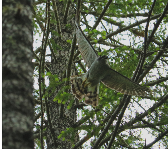
Figure 1: Soaring adult goshawk in second growth Douglas fir stand.