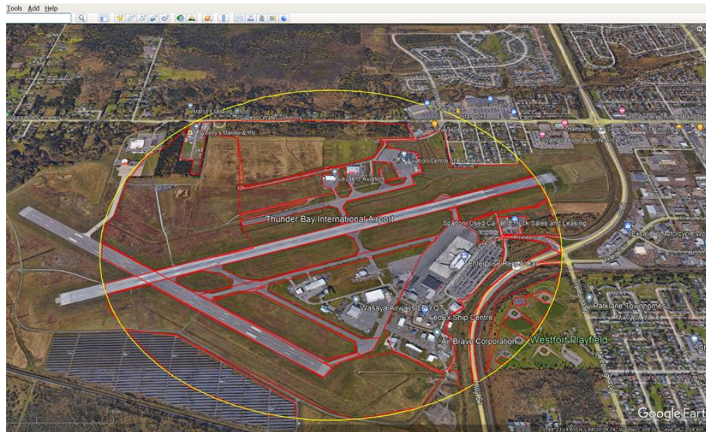
Fig 3: View of Thunder Bay International Airport from google earth pro with classified mowed, concrete, and vegetated areas.

The Thunder Bay International airport is situated on the downtown side of the city which is a developed area with lots of residential, commercial, and industrial buildings. The land cover of 2802357m 2 within a 1km radius of the airport was assessed