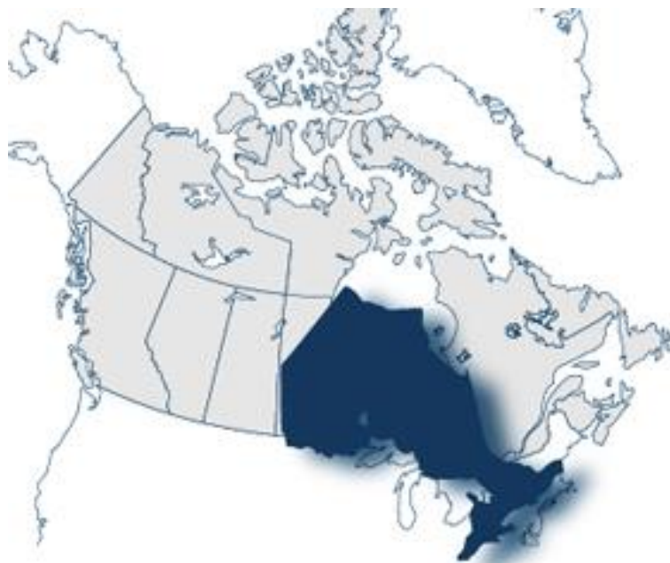
Figure 1. Map of Canada, Ontario is illustrated in dark blue (Government of Canada 2016).

Oak regeneration from prescribed fires is important to consider the best management techniques that should be used in oak-dominated stands. Proper management techniques are important in high value stands such as oak because of the need for high-quality stock that will provide a profit when selection cut. This thesis will take an in-depth look at the history of oak, the biology of oak, and the processes of oak regeneration. The focus will be on oak regeneration as a result of fires in Canada, with a special focus on Ontario, refer to Figure 1. The research conducted on oak regeneration will be through a compilation of various academic articles.