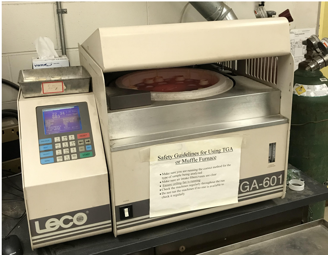
Figure 4. The Leco TGA-601 Thermogravimetric Analyzer conducting a proximate analysis.

The proximate analysis was conducted by the Lakehead University Wood Science Testing Facility using a Loss-On-Ignition (LOI) method to determine the ash, moisture, volatile matter (VM), and fixed carbon (FC) contents of the biochar. A Leco TGA-601 Thermogravimetric Analyzer (TGA) was used (Figure 4).