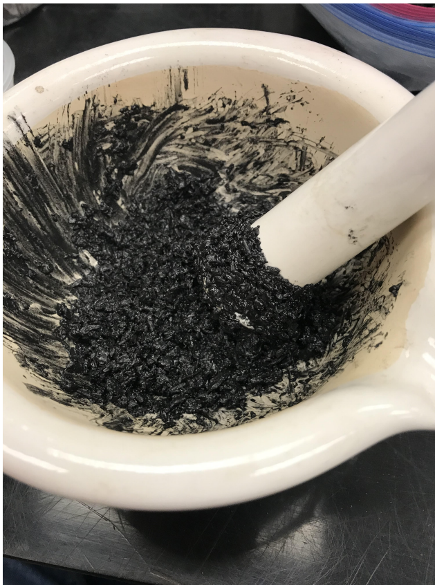
Figure 3. The biochar after being ground with the mortar and pestle.

One kilogram of the waste biochar was provided. The biochar was ground using a mortar and pestle prior to all tests (Figure 3). Half of the ground biochar was dried in a kiln while the other half was stored as is in plastic containers.