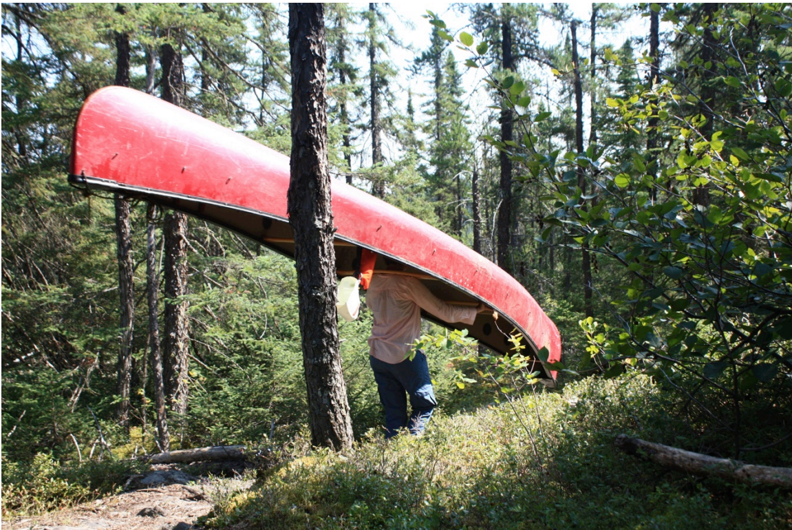
This photo was taken by my partner during a canoe trip on the Kopka River in August 2013.

Canoeing has become part of my life on the northern shore of Lake Superior. It's a way of being with land and water I will associate with the boreal forest, with jack pines, walleye, fresh water, moose, northern lights, bedrock, and loons for the rest of my life. The night before a canoe trip, I'm always scared. The first day of a canoe trip, I'm always grumpy, and usually will cry at least once. But it's as if the wild has to soften me again, has to disrupt my norms and bring me back to myself. The deep joy I feel in wild places is often so different than the happiness I feel in more urban places. It lives somewhere closer to my heart. Still, I often feel like I don't belong in the wild, that I'm not sufficiently skilled, resilient, nor determined enough to be 'out there'. And I always want to return. The tensions of adventuring amplify each time I carry a canoe. It hurts, and the blueberries taste so good. It's heavy, and the fire is so beautiful. I literally feel the tension in my shoulders and I keep walking excitedly to get to the next lake. Some days, I absolutely cannot carry my own canoe. I travel with friends. Some days feel more like paddling, others are like a portage. But every day in the wild seems to take me apart and put me back together again in a way that gets me closer to myself, to the ways I want to be in the world, to the learning I need to do to get there. This thesis experience has been wild.