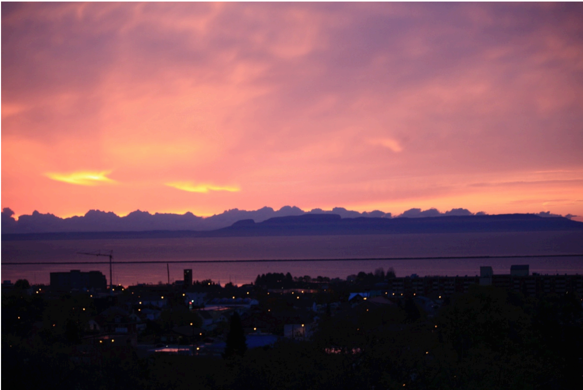
This photo is taken from Hillcrest Park in Thunder Bay, ON. From this vantage, you can see a part of the north end of the city. You can also see the Sleeping Giant, and Lake Superior.