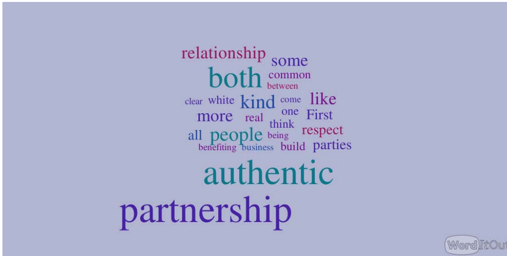
Figure 1: Word Cloud – Authentic Partnership

A pre-defined limit of 25 words was identified on a frequency of three words or more. Incorporating these definitions and the parameters into the word cloud software, (worditout.com), words that were commonly identified included: all, relationship, both, respect, benefiting, build, business, common, more, real. A definition to define authentic partnership based on this analysis is “a business relationship that builds through respect and during the interaction between both parties, where each party is clearly benefiting.”